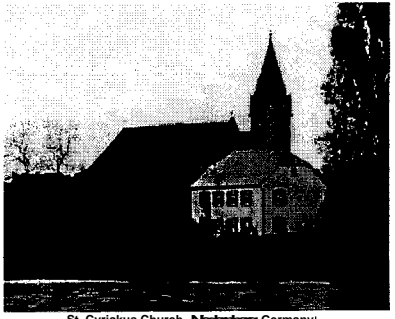
St. Cyriacus Church, Niedernberg, Germany Built in 1461 next to the Main River